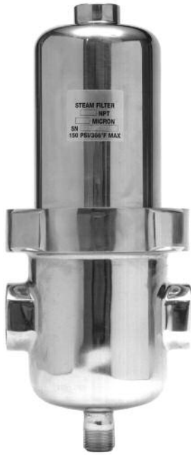
STEAM SCRUBBER FILTER