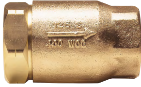
61-100 FEMALE x FEMALE THREADED 1/4" THROUGH 3"